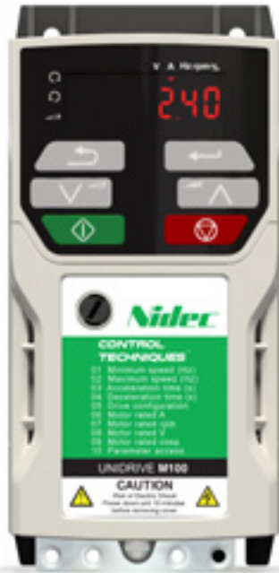
Unidrive M100 Frame Size 1