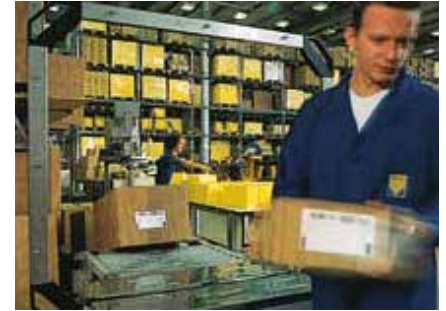
Manual Postal sorting