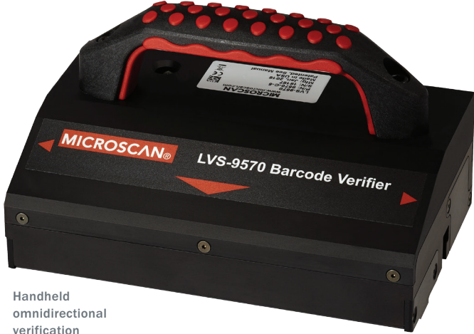
Handheld omnidirectional verification