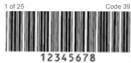
Example 1D (Code 39) Bar Code