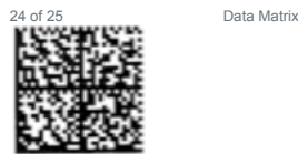
Example 2D (Data Matrix) Bar Code