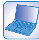
Interface configuration software