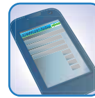
Interface configuration app