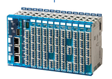
Eaton XC-303 modular PLC (with integrated web server)