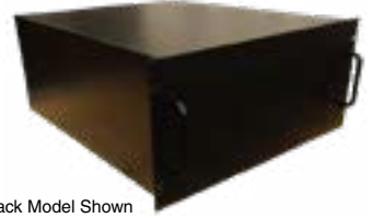
Rack Model Shown

*Always reference Spec Control Drawing (SCD) for the most current & accurate dimensions and weights